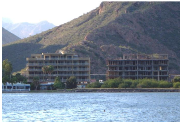
Phase I, to the left, was completed in February of 2008 and is fully sold out. Phase II is now complete and only seven units remain unsold. This photo was taken in August 2008.

Visit our website: villabahasancarlos.com